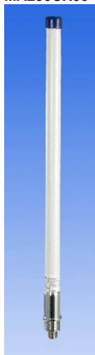
With 6 m cable and plastic base